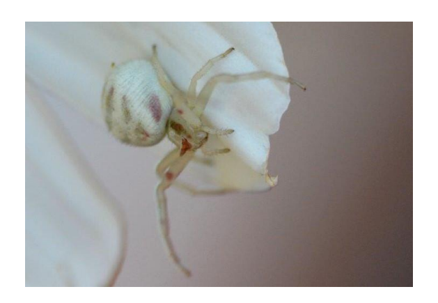
Picture shows male (L) and female (R) Flower Crab Spiders – aren't they a handsome couple?